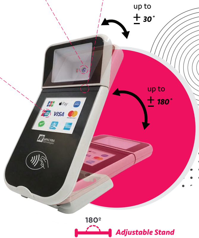
180° Adjustable Stand